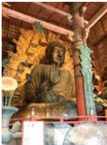
Marvel at the grandeur of the iconic Great Buddha!