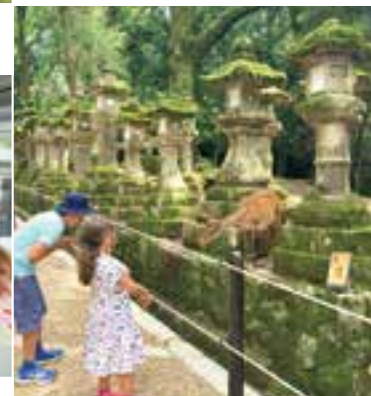
Sacred lanterns of Kasuga Taisha Shrine