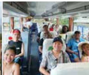
Travel in comfort with three rows of independent seats.