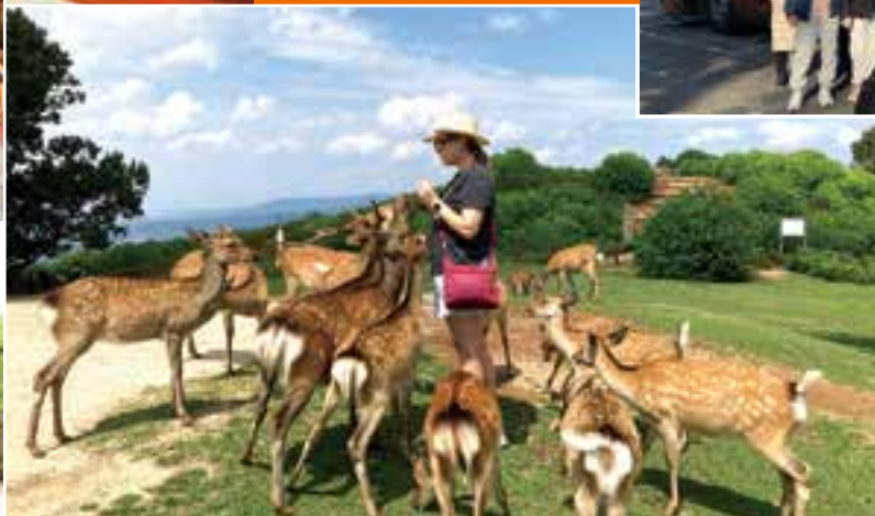
Take a sightseeing bus to the top of Mt. Wakakusa! Experience feeding the deer at the summit with its breathtaking panoramic views.