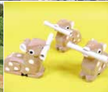
Deer Fortune drawing experience