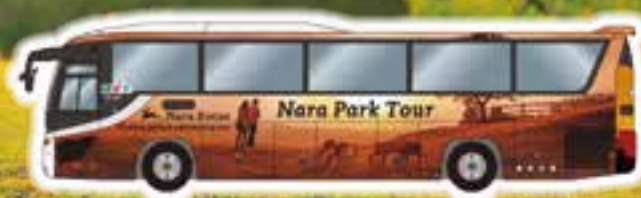
Half-Day Afternoon Bus Tour