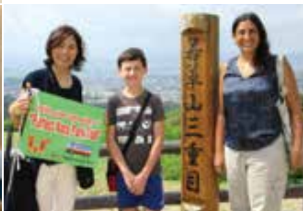
Our licensed guide interpreter will enrich your experience with insightful English commentary!